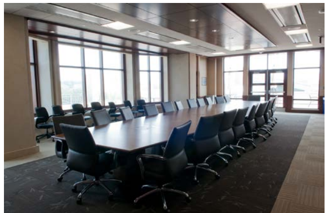
COBE Board Room