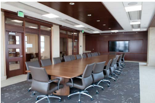
COBE Board Room